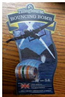
There are not many pump clips that show the brewery's cask colours